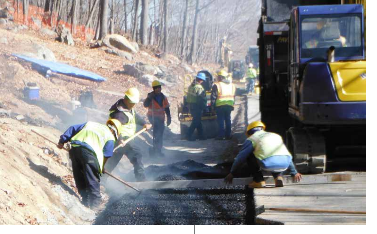
Wanaque Reservoir, Passaic County

projects (the Aspirational Funding Scenario).