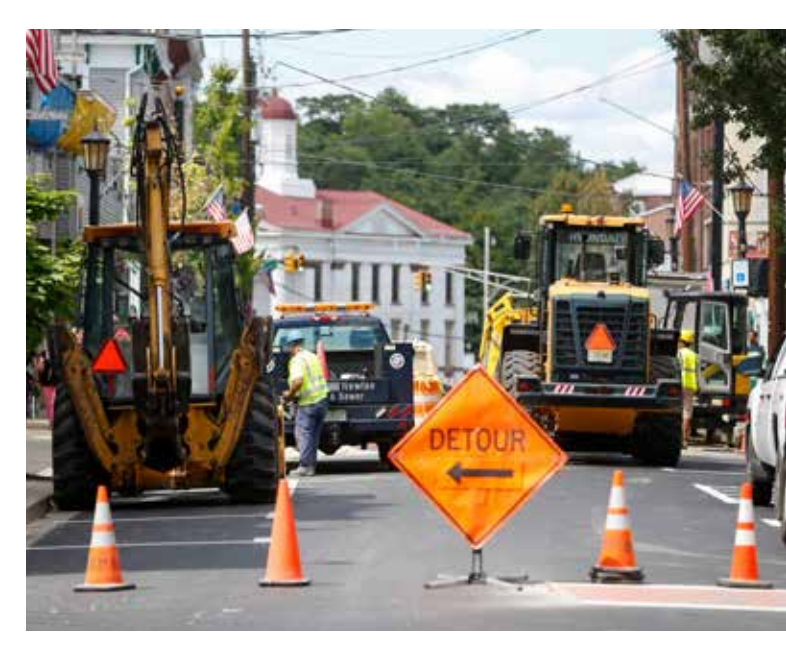
Newton, Sussex County

While the five-year FAST Act provided predictable federal transportation funding for the first time in many years, the federal program still faces significant revenue challenges. Motor fuel tax collections have not kept up with the program's needs. Among the reasons: the federal gasoline tax has not been raised since 1997; and motor fuel consumption continues to fall due to more fuel efficient vehicles, the use of alternative fuels and less driving associated with changing lifestyles and an older population, as described in Chapter 3. In recent years, Congress