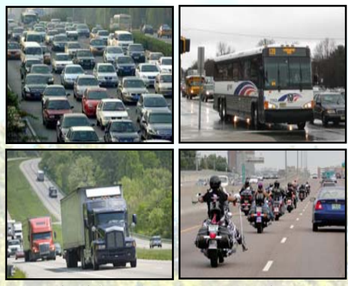
On-road mobile sources are a major contributor to air pollution in northern New Jersey.

Transportation plans and programs impact air pollution levels by affecting: