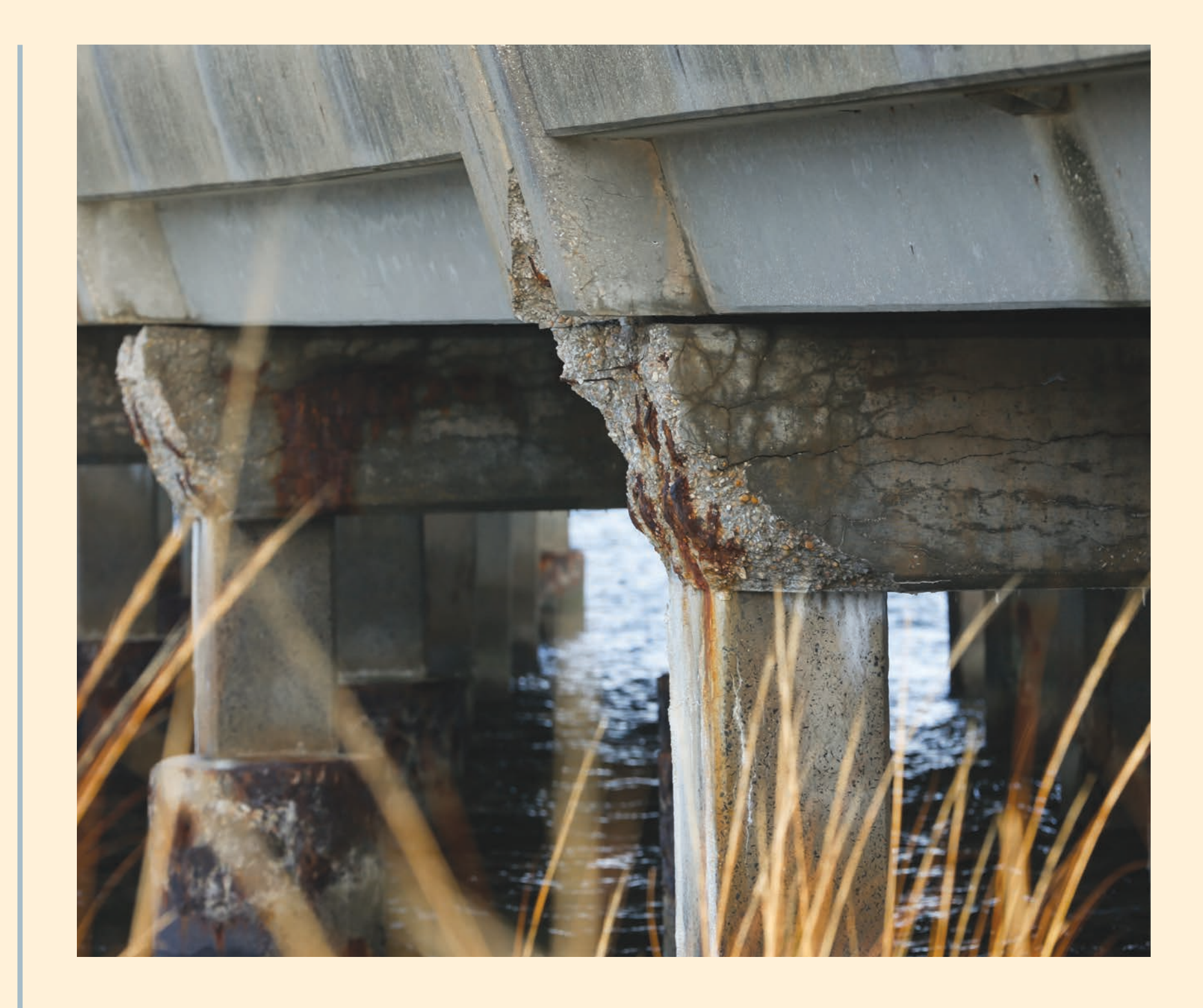
PROJECT DESCRIPTION: The project will investigate options for replacing or rehabilitating the bridge.