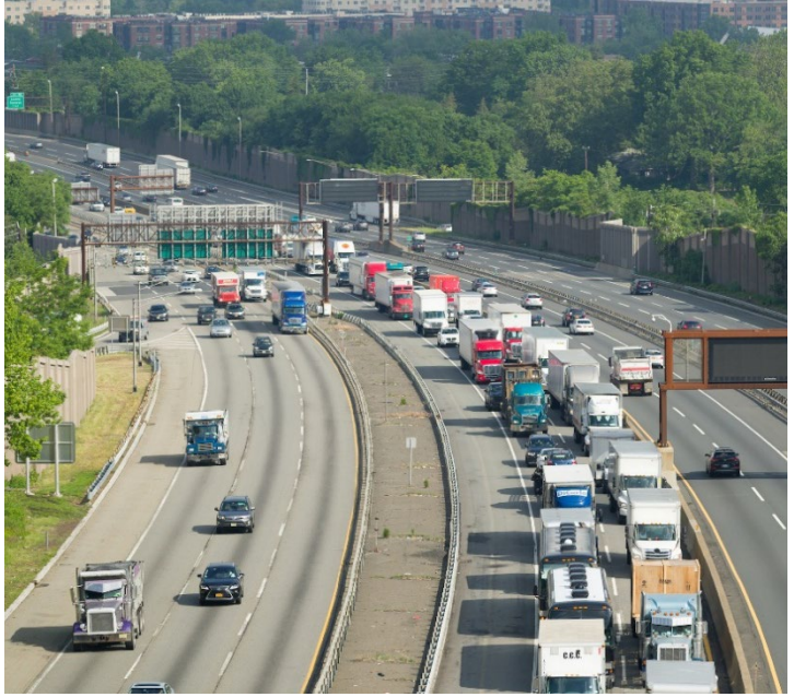
Truck Travel Time Reliability on Interstate Highways

Data to analyze this measure is based on the probe readings of trucks on segments of Interstate highways during 15-minute reporting periods, obtained from the federal government. This measure is computed based on data for each day of the week, all hours of the day.