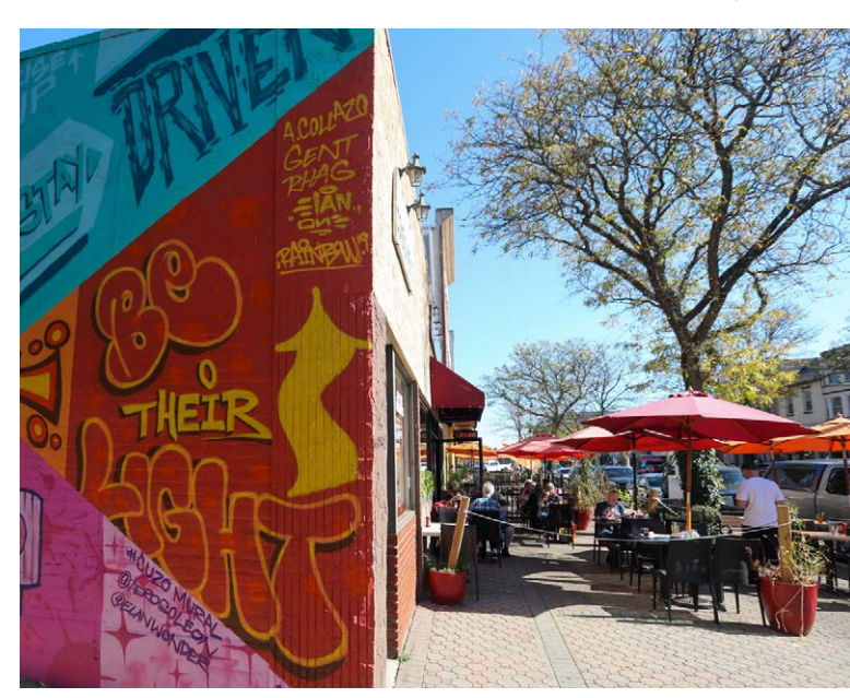
Somerville, Somerset County

Future safety investment directions include systemic improvements that focus on increasing safety on high crash corridors, rather than focusing on single