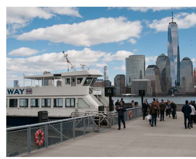
Jersey City, Hudson County

■ The NJTPA will support further development and implementation of the NJ TRANSIT 10-Year Strategic Plan and a 5-Year Capital Plan, and the Port Authority Capital Plan for 2017-2026 through its ongoing planning as well as capital programming activities to fund projects as required through the TIP. It should be noted that several proposals in