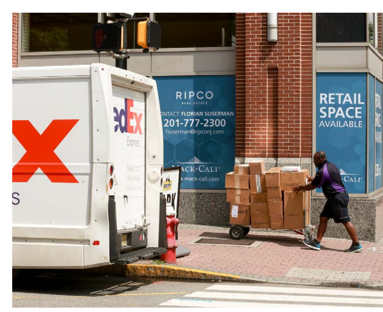
Hoboken, Hudson County