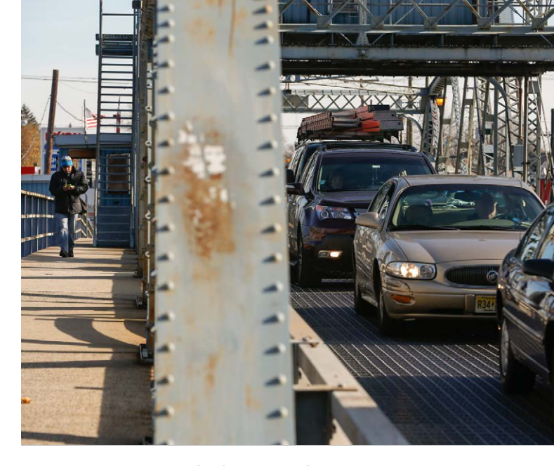
Kingsland Avenue Bridge, Bergen/Essex Counties