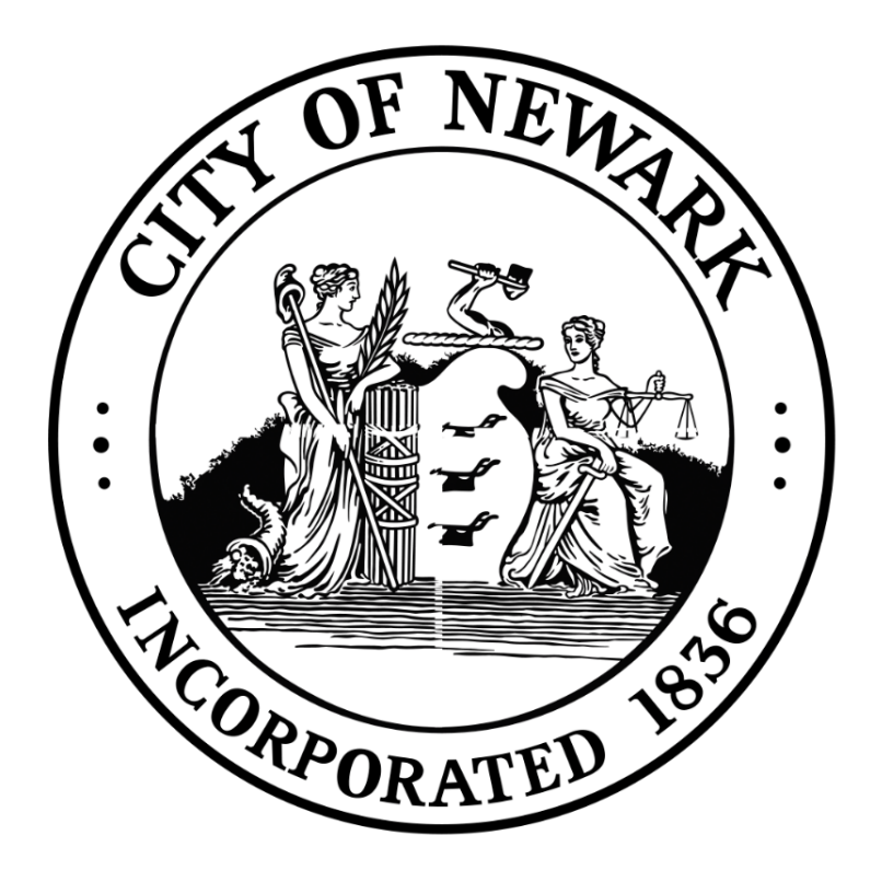
FY 2022 SUBREGIONAL TRANSPORTATION PLANNING (STP) WORK PROGRAM - ELECTIVES