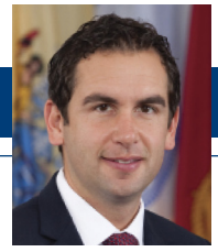
Steven M. Fulop Mayor, Jersey City NJTPA Trustee

The City of Jersey City received a $8,142,000 grant for this project through the NJTPA's FY 2022 Local Safety Program (LSP). The grant includes funding for preliminary engineering, final design, construction and construction inspection services. The project will improve safety and overall operations at 33 intersections along approximately 1.5 miles of Summit Avenue between Route 139 and Secaucus Road.